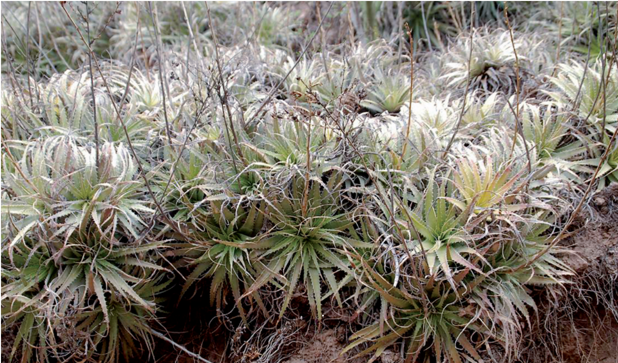
Fig. 23. A species of the bromeliad genus Puya showing the dead leaves that serve as a substrate for Perichaena calongei .

na (Fig. 23). It has proved to be an excellent substrate for myxomycetes as cultures of the leaf bases have been over 94% positive for myxomycete fruiting bodies or plasmodia. No other substrate, of the more than 100 moist chamber cultures, prepared with native plant remains from the same areas produced this species. It therefore appears to have microhabitat requirements found so far only in this plant genus.