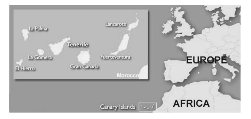
Map 1. The Canary Islands geographical location.

LA PALMA: (P-1) Mazo, Montaña del Azufre, 28°33'23''N 17°46'12"W, 190 m, anthropic Euphorbia lamarckii community (c); (P-2) Puntallana, on the way to Martín Luis, 28°43'10"N 17°44'36"W, 150 m, (b); (P-3) Garafía, Santo Domingo, 28°48'51"N 17°57'40"W, 190 m, (a).