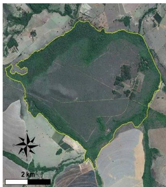
Fig. 2 – Demarcation (yellow line) of the FloNa of Silvânia, seen by satellite (Source: Google Earth, on 08/08/2012, modified by the authors).